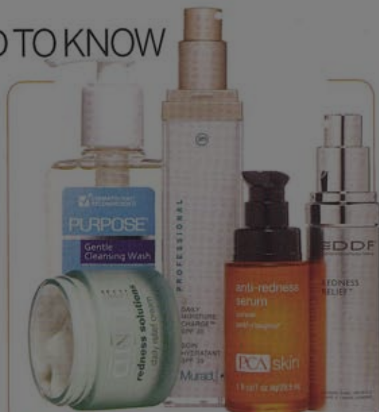
RED RESCUERS Clinique Redness Solutions Daily Relief Cream, $40; Purpose Gentle Cleansing Wash, $6; Murad Professional Daily Moisture Charge SPF 30, $100; PCA Skin Anti-Redness Serum, $55; DDF Redness Relief, $48

Theories on the cause of rosacea include a chronic bacterial infection, parasitic mite infection and, according to a new study by the University of California at San Diego, an overabundance of three immune system proteins. Until an exact cause is pinpointed, "the simplest solution to minimizing flare-ups is to cut out what's activating your symptoms," Dr. Lancer says. Keep a skin diary to identify triggers. And see your derm, who will likely prescribe both a low-dose oral antibiotic (such as Oracea) to kill bacteria within the skin and an antibacterial cream or gel. If your rosacea is mild, wash with an over-the-counter cleanser made for red or sensitive skin (such as Eucerin Redness Relief Soothing Cleanser, $9). For bumps and fierce flushing, opt for an Rx wash such as Rosanil. Finally, trade potentially skin-stripping retinols and hydroxy acids for antiagers made with gentler peptides. "They send a signal to nerves to slow down muscle movement, softening wrinkles," Dr. Fusco says. (A peptide-rich pick: T'Fivve Anti-Aging Skin Revitalizing Complex, $78.)